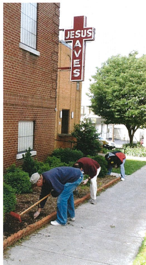
Three “Tabitha Project” members volunteer by laying mulch outside the Rescue Mission’s Fralin Chapel.