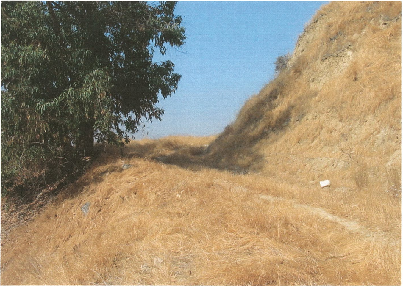
CARRIAGE TRAIL, PRIOR TO DAMAGING STORMS OF 2010, 11