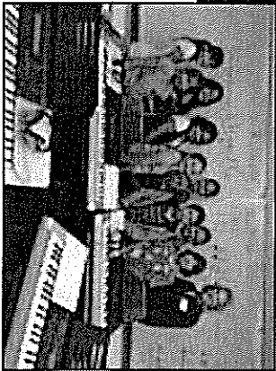
Visit from President of the Palm Springs Unified School District Board